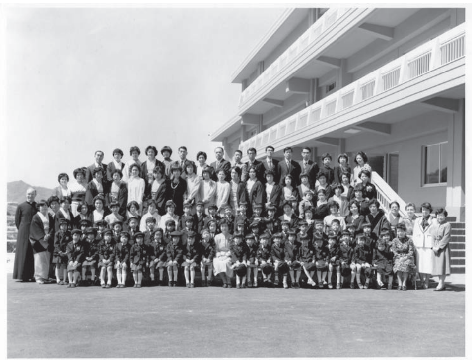
The first promotion of students of the Nagasaki Seido School.